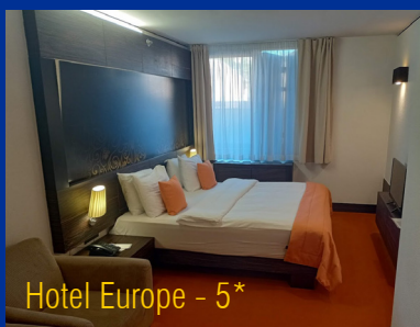
Hotel Europe - 5*