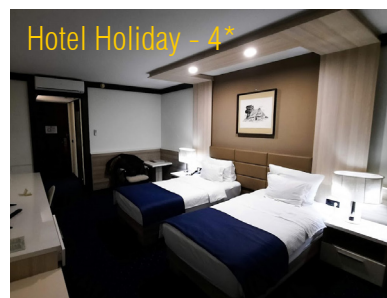
Hotel Holiday - 4*