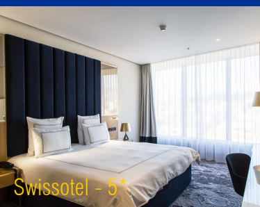
Swissotel - 5*