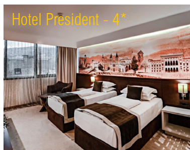
Hotel President - 4*